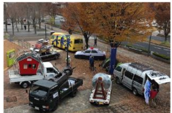
CART Camp & Caravan @ Saitama Triennale 2016 (November 2016)

Meanwhile at art spaces in Iwatsuki-ku and Nishi-ku, artists create and exhibit works during their stay as part of the “Saitama Artist-In-Residence Program.”